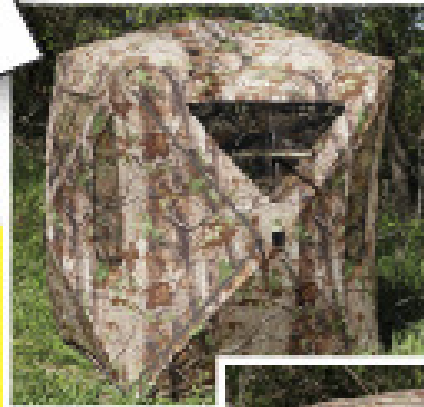
Hide 'N Hunt Blind