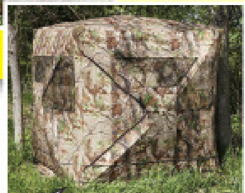
Primetime® Ground Blind